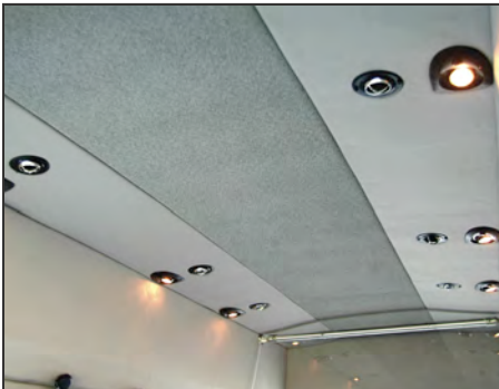
Interior headliner features high intensity reading lights & individual manual air vents

(Note: This is only a partial listing of optional equipment. For more complete information, contact your Eldorado National representative.)