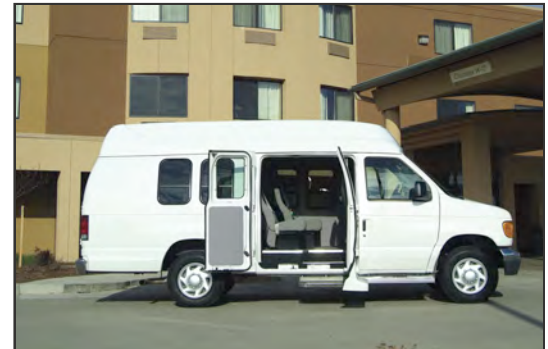
Convenient contoured ambulatory entry step at side cargo door