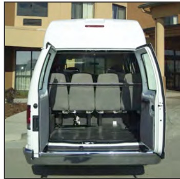
The Express' spacious rear luggage compartment can take over-sized luggage & packages.